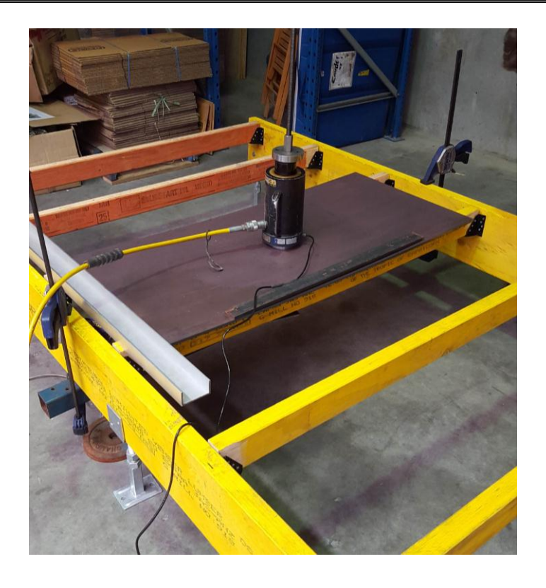
Figure 1: Joist hangers test setup

Client: KLEVAKLIP SYSTEMS PTY LTD Page 3 of 3